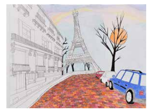
Lot #14 Will Page + Zanna Feree "Sunset in Paris" Colored Pencil and Pen on Paper Opening Bid: $100