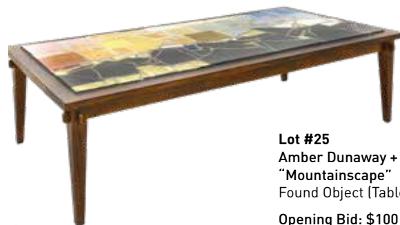
Lot #25 Amber Dunaway + Dawn Perrin "Mountainscape" Found Object (Table) and Ceramic Mosaic Opening Bid: $100