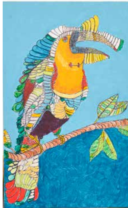
Lot #17 Neil Dignan + Gary Gaffney "Colorful Toucan" Acrylic on Wood Panel Opening Bid: $100