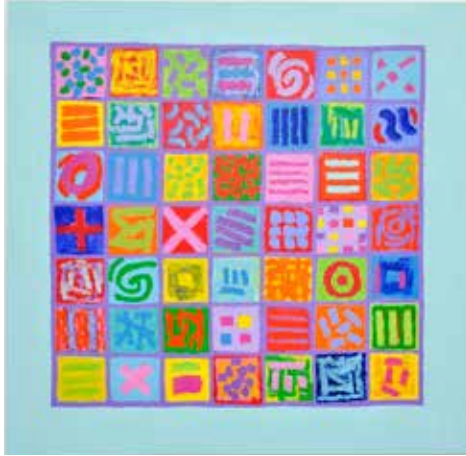
Lot #8 Candi Branham + Brian Bitter "Guardian Angel 3D" Mixed Media Opening Bid: $100