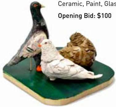
Lot #23 Neil Dignan + Seana Higgins "Three Amigos" Ceramic, Paint, Glass, Wood Opening Bid: $100