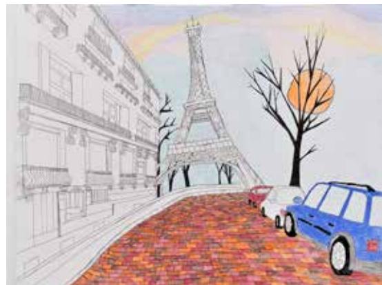
Lot #14 Will Page + Zanna Feree "Sunset in Paris" Colored Pencil and Pen on Paper Opening Bid: $100