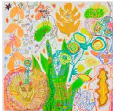
Lot #24 Linzy Page + Jacqueline Picton "Jungle Fever" Acrylic and Paint Marker on Panel Opening Bid: $100