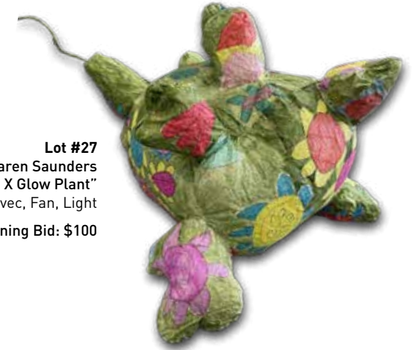
Lot #27 Jennifer Crowe + Karen Saunders "Spikesorius Visionarius X Glow Plant" Tyvec, Fan, Light Opening Bid: $100