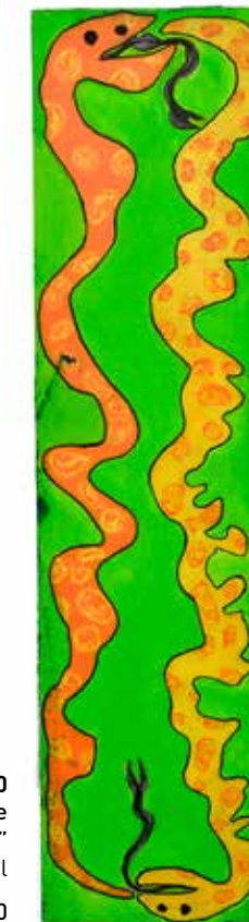
Lot #20 Nick Kraft + Drew Yakscoe "Twin Snakes" Acrylic on Panel Opening Bid: $100